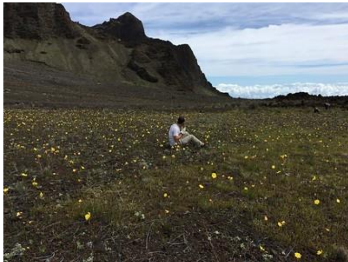
Weeds like those in this 2018 photo will still need pulling when our service trips make it back into the crater.