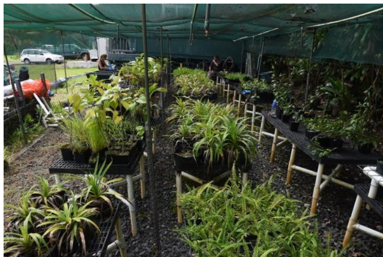
Kīpahulu greenhouse plants flourish in this photo from an August 2019 service trip. Park staff have been keeping up with weeds and the greenhouse during the shutdown.

“We’re learning as we go,” Domingo said. For example, enclosed spaces, like park headquarters and the visitor center near the summit, are closed to visitors, and staff are trying to figure out how they themselves can safely use the buildings while maintaining recommended social distancing. Most employees continue to work from home. The backcountry remains closed at this time due to limited emergency response from both NPS and Maui County responders. These closures are in support of State and County emergency restrictions to decrease potential spread of Covid-19 on the island of Maui, protect visitors and prevent visitors from entering backcountry areas where emergency services are not currently available. If you’re looking for a longer hike than the trails at Hosmer’s, Pā Ka’oao or Leleiwi Overlook, each less than a mile round-trip, try the Supply Trail, 4.6 miles round-trip. It runs from Hosmer’s Grove to the junction with the Halemau’u Trail (which is closed).