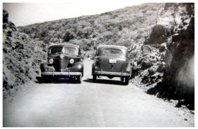
The new road completed in 1935 was narrow, but it made getting to the summit a lot easier.

Being inside the crater walls was like being in on another planet, and yet uniquely Hawaiian. In this incredible place you were cut off from the world you had known. At night under the sparkling stars, very close in the thin air, the silence was so profound it made your ears ring. Once in a while you heard a bird call.