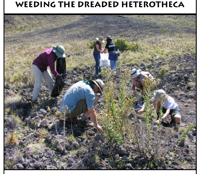
Friends of Haleakalā National Park volunteers help control heterotheca near Hōlua. Heterotheca is a member of the aster family. This invasive nonnative plant, whose yellow flowers send thousands of seeds into the air, is one of the weeds Friends' volunteers target on monthly services trips. Interested in joining us for fun as well as work? See the service trip schedule on page 4.

During the treatment at Hōlua campground, park managers used ant poisons that have little to no odor and are extremely low to non-toxic to humans and non -target animals. Treatment notice signs were posted in the area, and visitors planning to hike near the Hōlua area were encouraged to use other on-trail areas for resting spots.