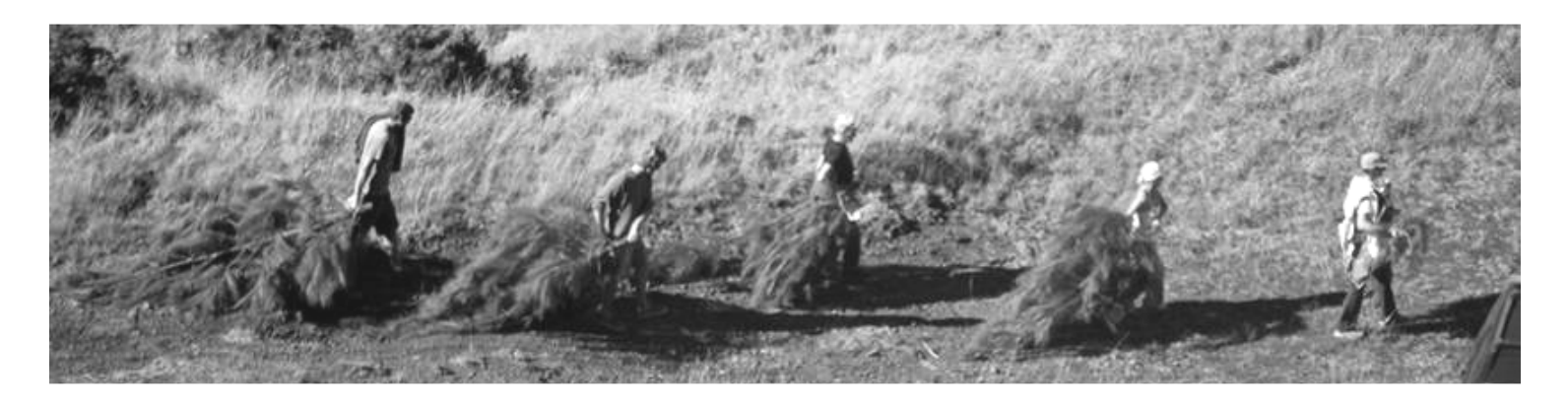
A parade of volunteers hauls invasive pine trees cut from the Pu'u Niauniau area adjacent to the Park during the annual Christmas Tree Cutting event sponsored by the Friends of Haleakalā and the Pacific Whale Foundation in 2009. See the article in this newsletter for information about this year's event.

News from the Park – continued from page 1