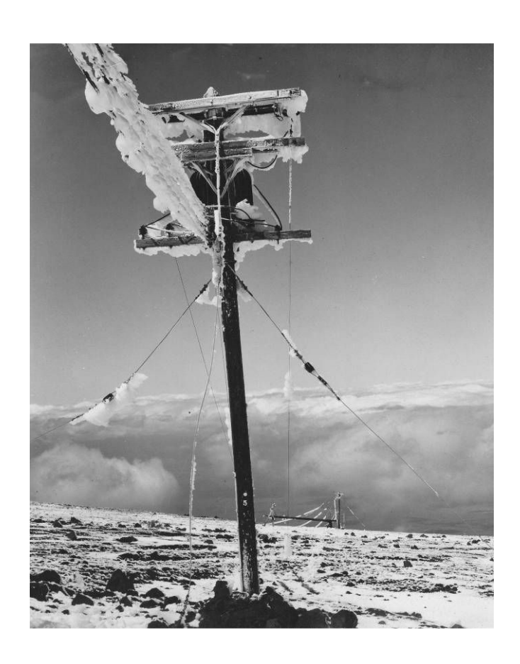
Results of an ice storm that shut down the transmitter atop Haleakalā for nearly two weeks in 1962

almost turned over his car. The wind took roofs off KMVI's garage and entryway, and tumbled the tower of a neighboring television station transmitter.