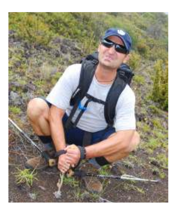
A mighty struggle against the invasive heterotheca

Please see the schedule printed elsewhere in this newsletter for trip dates and visit the FHNP website where you will be asked to register for an FHNP account. Registering will put you on our electronic newslist which provides email updates on service trip schedule changes.