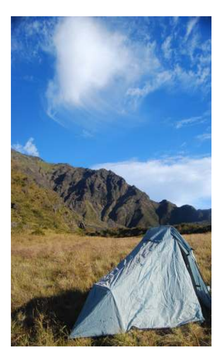
Tent Camping at Waikau - Base camp for a heterotheca eradication service trip.

Please call (808)572-4487 to learn more about volunteering for Haleakala National Park.