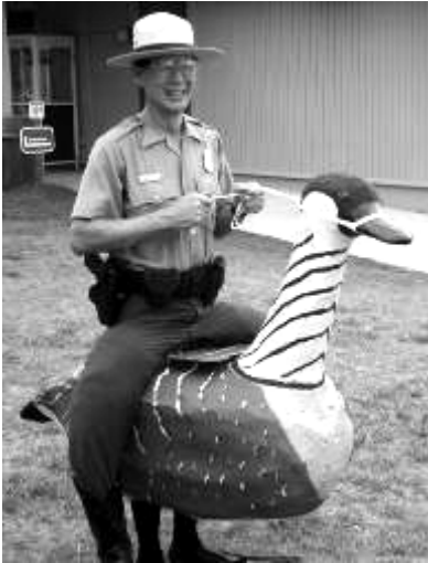
Haleakalā Mounted Rangers ...

He leaves with many great stories, told with a lot of laughter. "All the people over the years, that's the fun part of it," he says. "Carnivores and vegetarians, the teetotalers and the drunkards."