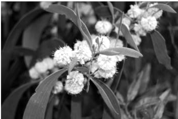
Koa in bloom along the Kaupo Gap Trail