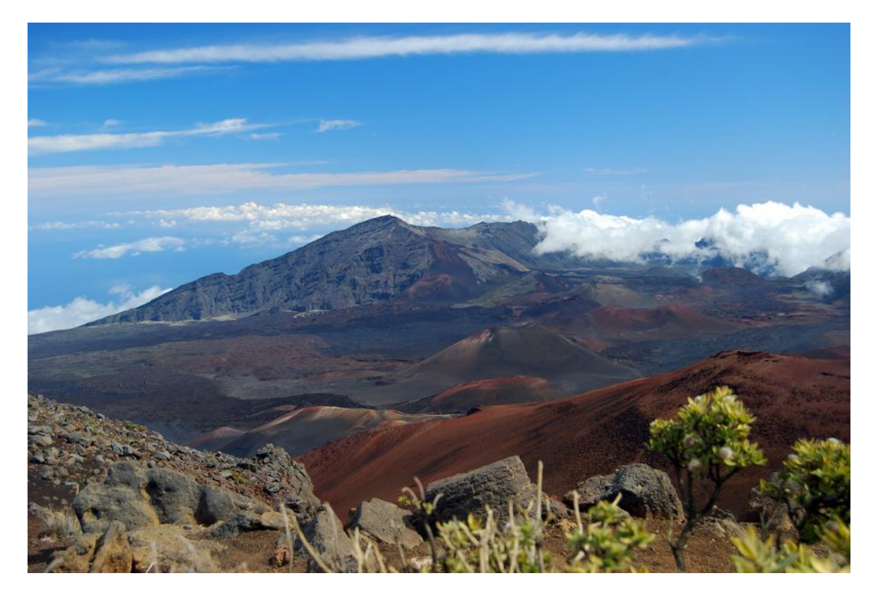
LOOKING NORTHEAST TOWARD HANAKAUHI PEAK