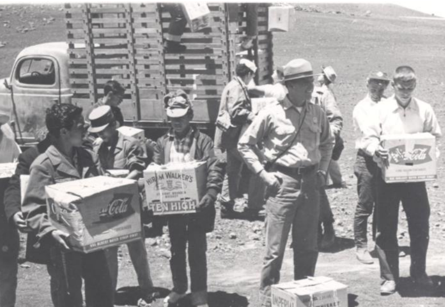
Boy Scouts prepared to haul boxes of nēnē to Palikū in June 1962.

When the scouts finally freed their feathered burdens, the n\bar{e}n\bar{e} joined a tiny new