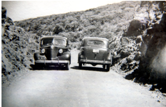
The new road completed in 1935 was narrow, but it made getting to the summit a lot easier.

Being inside the crater walls was like being in on another planet, and yet uniquely Hawaiian. In this incredible place you were cut off from the world you had known. At night under the sparkling stars, very close in the thin air, the silence was so profound it made your ears ring. Once in a while you heard a bird call.