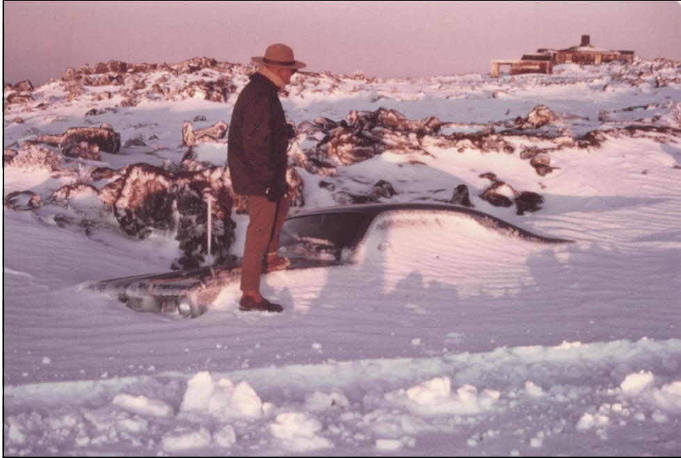
A ranger stands beside a car that met with trouble on the icy road and ended up buried during a 1971 snowstorm.

H ere comes winter, and maybe snow. It's always a thrill to look up from the low lands of Maui and see snow atop Haleakalā. Such a thrill, in fact, that many local residents hop into their cars and head up to get their hands on the white stuff. This is a real problem for Haleakalā National Park staff, who must deal with excited folks not equipped to drive on icy roads (and maybe under dressed for the weather) while protecting the park's natural resources.