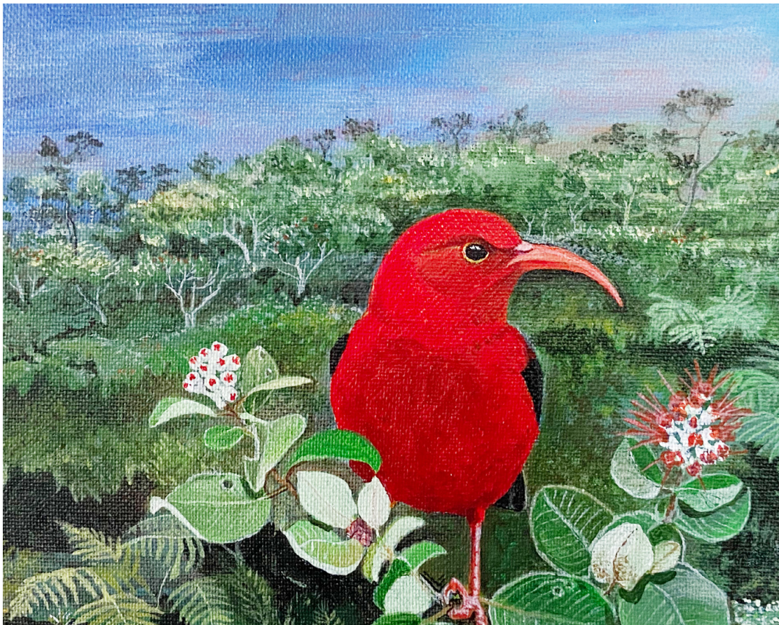
ʻiʻiwi

Not so, says the U.S. Department of the Interior. At the end of June it promised to invest $14 million in the rescue of these birds. That money will come from Congress's Bipartisan Infrastructure Law, a portion of which was targeted at ecosystem restoration and resilience. Funds will go toward abating the bugs and augmenting captive breeding programs. Said U.S. Rep. Ed Case, “The funding will assist the state in combating mosquitoes that especially threaten endangered forest birds found nowhere else in the world.”