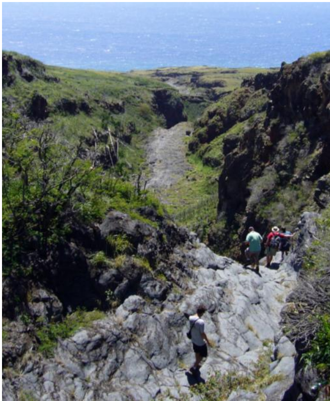
A narrow strip of new lava flowed down the eroded streambed called Kepuni Gulch.

because evidence of some eruptions may be covered by lava from newer ones, but it appears that the mountain undergoes periods of relatively frequent activity separated by periods of infrequent eruption. Apparently we are now in one of those quiescent periods between eruptive episodes.