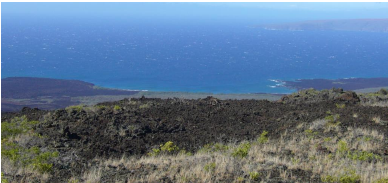
La Pérouse Bay