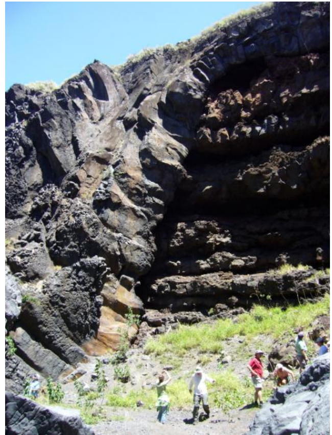
Wai‘ōpai Gulch is an old, eroded flow (right) draped with relatively new lava (on the left).

An exact record of eruptions isn't available,