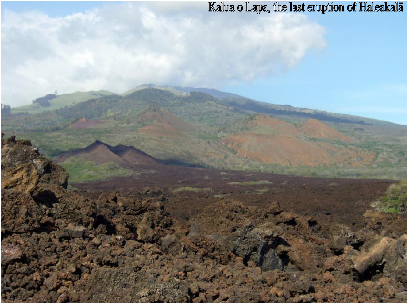
Kalua o Lapa, the last eruption of Haleakalā

Friends of Haleakalā National Park P.O. Box 322 Makawao, HI 96768