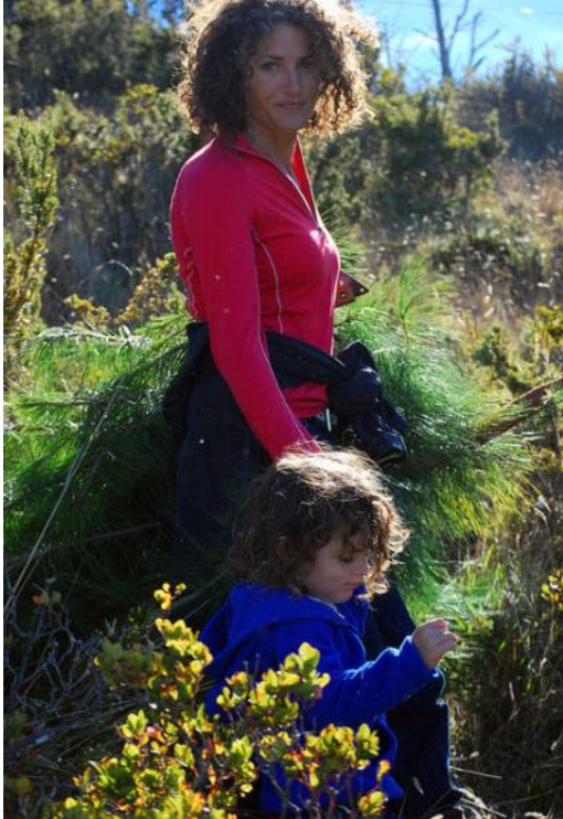
Our annual Christmas tree cutting project helps control invasive pines and offers families an outdoor adventure—plus some Christmas greenery!

P.O. Box 322 ☀ Makawao, HI ☀ 96768 ☀ www.fhnp.org