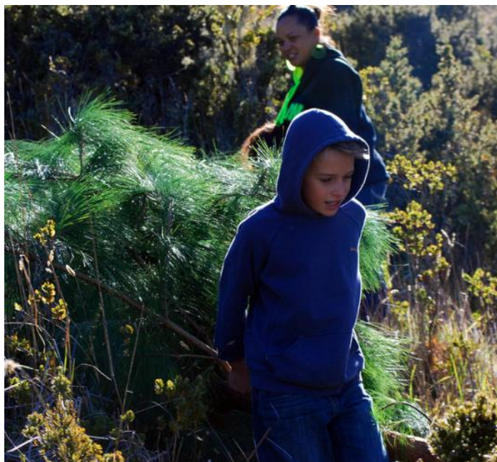
A determined young man hauls his Christmas tree down the hill after a day of removing invasive pines.

Time to fill your home with fresh Christmas greens and the scent of pine, while helping preserve native species on Haleakalā. It's a great family activity, one that could become your Christmas tradition!