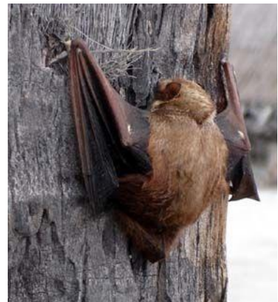
An ‘ ōpe‘ape‘a , or Hawaiian hoary bat, clings to a tree. The only land mammal native to Hawai‘i is rarely seen.

‘ Ōpe‘ape‘a are found from the sea to the summit. They escape winter’s wet weather by migrating up the mountain slopes—possibly following the lead of the Hawaiian koa moth, a favorite snack. Scientists speculate that cool, high-elevation temperatures allow the bats to rest at a lower metabolism. During the warmer months, they tend to forage closer to shore, which makes summer the best time to spot ‘ ōpe‘ape‘a . Just after sunset, when the trees are silhouettes against the still-blue horizon, look for a wee shape swirling and somersaulting in the sky.