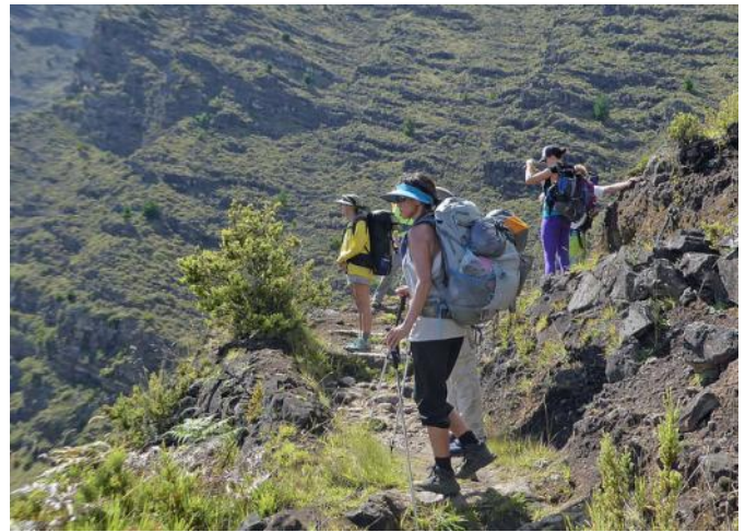
Service trip volunteers admire the view while hiking the Halemau'u Trail.

We hike out Kaupō Gap on some Palikū trips, but will restrict these to more experienced backpackers. Before signing up for a service trip, please go to the FHNP website at www.fhnp.org , create an account, then log into the account to learn more and certify your readiness for a service trip. As of press time, trip leaders have not been assigned, but you can learn more by checking the website for updates or email matt@fhnp.org for information or to sign up.