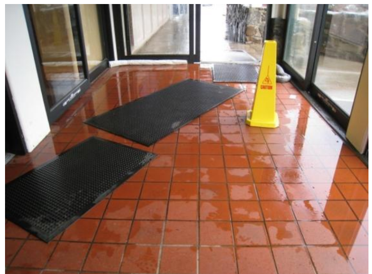
Inclement weather led to slippery floors in an entrance way oriented to catch the rain.

The Headquarters Visitor Center roof, seismic and structural work are estimated to cost $238,741. The renovation of the building’s entrance is estimated to cost $54,170. Both projects are funded by park entrance fees.