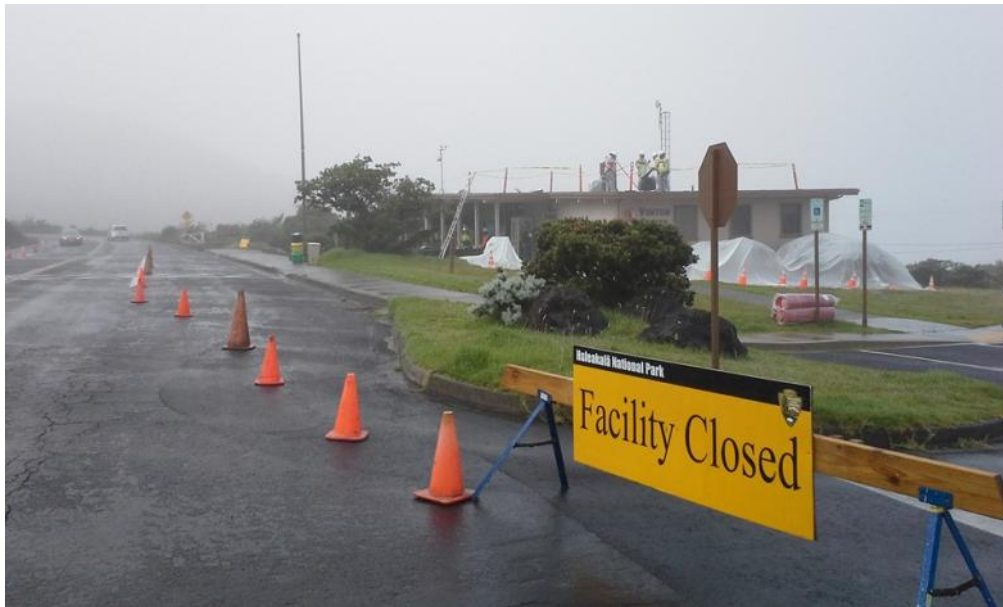
Workers remove roofing during renovations of the Headquarters Visitor Center a mile above the park entrance. Roof replacement and other repairs will close the headquarters building until late November.

If you’ve ever walked into the Haleakalā National Park Headquarters Visitor Center on a rainy day, you probably noticed that the entry door was placed just right for catching the rain, so that rugs were required to prevent visitors from slipping. Inside, looking up, you might have observed a long crack in a ceiling beam, the kind of thing that could cause trouble in the event of an earthquake.