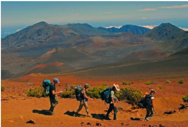
FHNP volunteers trek across the crater during the October 2012 service trip.