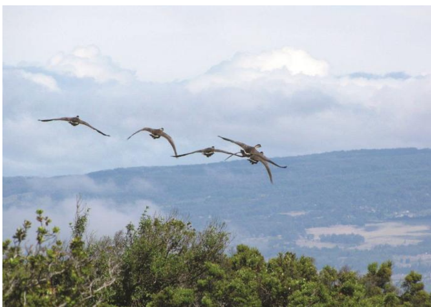
Nēnē soar across the sky with Haleakalā in the background. Once nearly extinct, the birds have regained a foothold in the Islands with help from human friends.

Miraculously, the species survived—thanks to a few determined individuals. Starting in 1949, territorial (and later state) wildlife biologist Ah Fat Lee oversaw a nēnē captive breeding program on at Pōhakuoloa the Big Island. Two females birds and one male were sent halfway round the globe to Sir Peter Scott’s waterfowl refuge in Slimbridge, England. The valuable stud, christened Kamehameha, produced 49 descendants. Some of these British-born birds accompanied the Boy Scouts into Haleakalā.