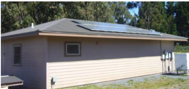
The park's new archives building

Researchers can make appointments to work in the park archives by calling 572-4476.