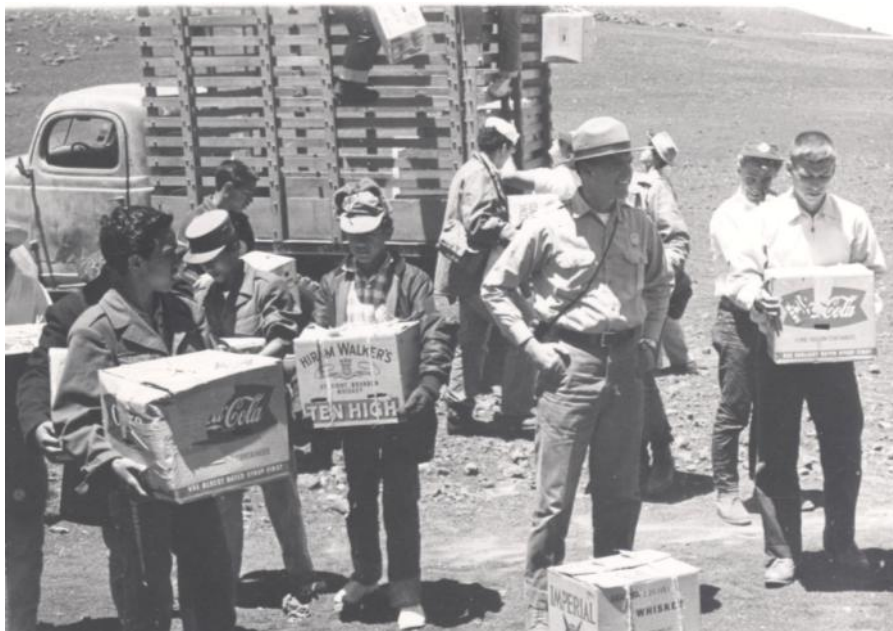
Boy Scouts prepared to haul boxes of nēnē to Palikū in June 1962.

Nēnē ( Branta sandvicensis ) number among Earth's rarest beasts. They're a tangible link to Hawai'i's paradise lost. Half a million years ago, around the time the Big Island bubbled